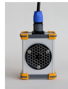
Ultrasonic Dynamic Speaker Vifa