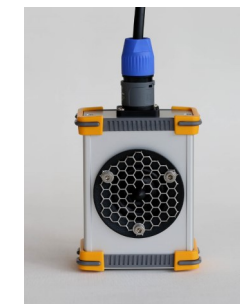
Ultrasonic Dynamic Speaker Viva